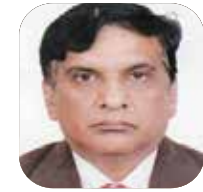
Dr. Karim Ahmed Khawaja Former Senator