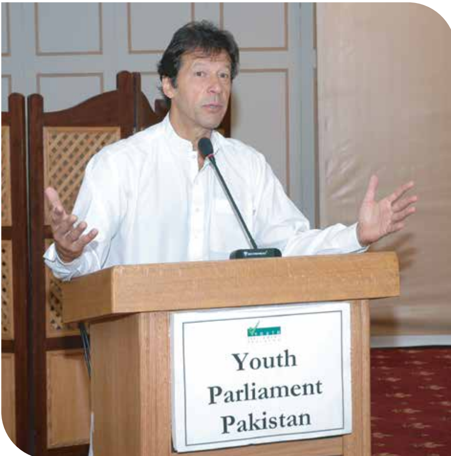
Mr. Imran Khan, Chairman PTI; Prime Minister of Pakistan

The aim is to strengthen Pakistani nationalism within the youth especially in these times when scepticism and self-doubt is being spread among the youth. YPP aims to reinforce faith and confidence amongst the future political, corporate, business, technological leaders of the country and give them a platform to develop and bolster their vision for the country