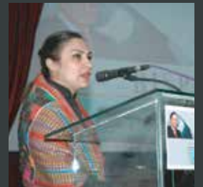
Ms. Marvi Memon Former Chair BISP