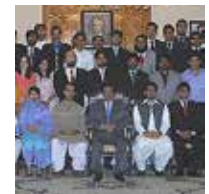
Mr. Asif Ali Zardari

Chairman Senate Senator Raza Rabani and Chair Senate Foreign Relations Committee Senator Mushahid Hussain Sayed invited MYPs in the Banquet Hall of the Parliament for interaction.