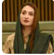
Ms. Maleeka Bukhari MNA; Parliamentary Secretary on Law & Justice