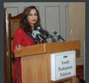
Senator Sherry Rehman