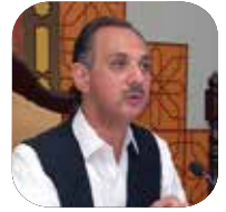
Mr. Omar Ayub Khan MNA; Federal Minister