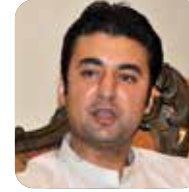
Mr. Murad Saeed MNA; Federal Minister for Communications