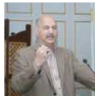
Mr. Mushahid Hussain

A key emphasis is placed on learning and capacity building of members through talks and interactions with leading policy makers and thinkers in various fields of life. Each Youth Parliament has held interactions with and has been addressed by successive Presidents of Pakistan, Prime Ministers of Pakistan, Chief Justices of Pakistan, Presiding Officers of the Parliament, Federal Ministers and Officials, National Security Advisors, Governors and Chief Ministers of Pakistan's Provinces, and leaders of key Political Parties. Such eminent Pakistanis have included Mr. Imran Khan , Chairperson of the PTI and current Prime Minister of Pakistan, Mr. Yusuf Raza Gilani , Prime Minister, Mr. Shaukat Aziz , Prime Minister, Mr. Asif Ali Zardari , President of Pakistan, Justice Iftikhar Muhammad Chaudhry & Justice Anwar Zaheer Jamali , Chief Justices of Pakistan, among others.