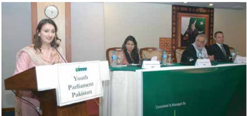
Ms. Maleeka Bokhari , MNA; Parliamentary Secretary Law & Justice