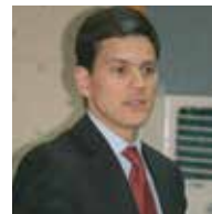
Mr. David Miliband