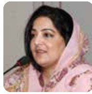
Ms. Anusha Rahman Khan Former MNA & Federal Minister