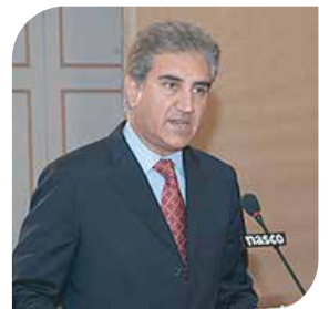
Makhdoom Shah Mahmood Qureshi, MNA; Foreign Minister of Pakistan