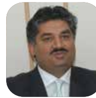
Mr. Khurram Dastgir Khan MNA; Former Federal Minister