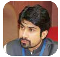
Nawabzada Saifullah Magsi Former Senator