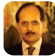
Rai Aziz Ullah Khan Former MNA & Chair National Assembly Standing Committee on Sports, Culture, Tourism & Youth Affairs