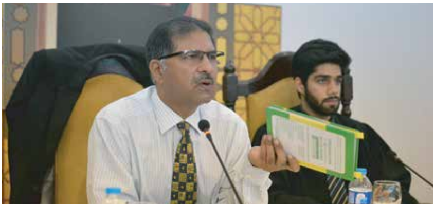
Senator Ali Zafar , Chair Senate Standing Committee on Law & Justice