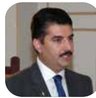
Mr. Faisal Karim Kundi Former MNA & Deputy Speaker National Assembly of Pakistan