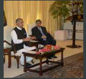
Mr. Shaukat Aziz Former Prime Minister