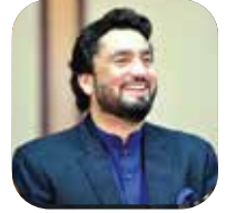
Mr. Shehryar Afridi MNA; Former Federal Minister